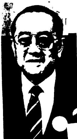
Dr Hiroshi Nakajima, WHO's director general